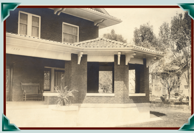
The deep overhangs and wide porch shade east-facing rooms from the morning sun. The Blount home and Model-T are visible in the background, c. 1920's.