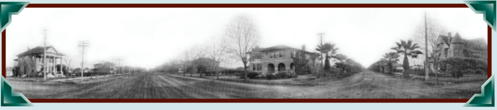
Looking north along Center Street (left) at McKinley Street, c. 1915. The Ellis-Shackelford home is nearly one-half mile to the north.