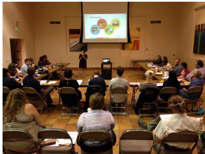
Workshop at the Museum of Northern Arizona in Flagstaff