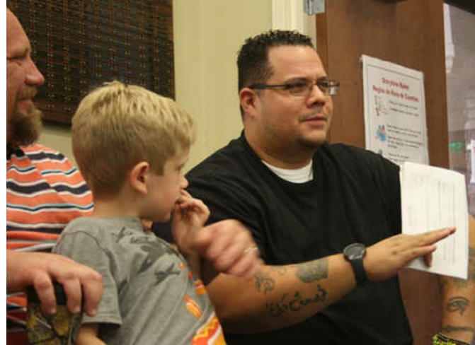
FRANK Talk at City of Maricopa Public Library

Special thanks to the libraries who hosted FRANK Talks: Dusenberry-River Branch, Tohono O'odham Nation - Venito Garcia, Copper Queen, Pinetop-Lakeside, Chandler Basha, Globe, Chandler Hamilton, Maricopa, Chandler